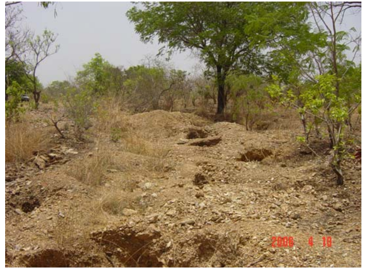
Sapelliga artisanal gold workings