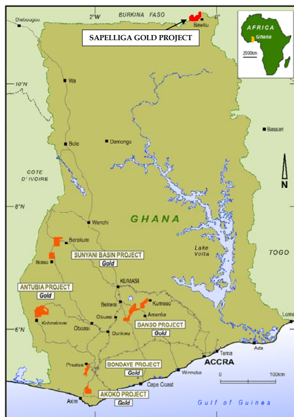
CASTLE MINERALS LIMITED GHANA PROJECT LOCATIONS

Castle now has six project areas covering more than 1,200km 2 in Ghana