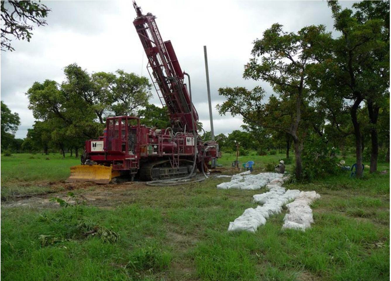
Follow-up RC Drilling at Baayiri prospect June 2011