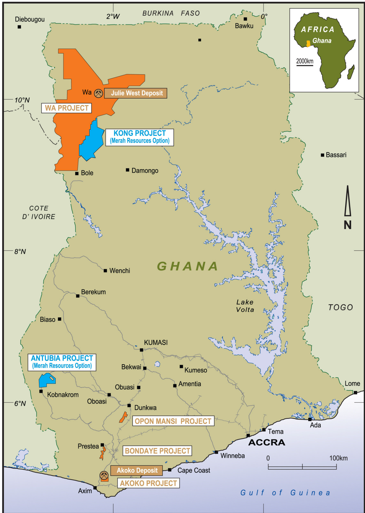
Castle's Ghana Projects